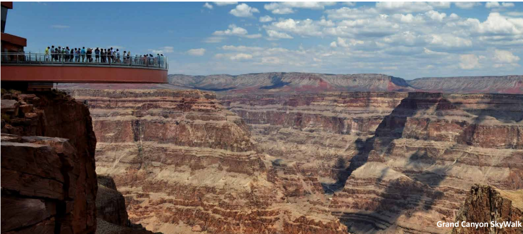
Grand Canyon SkyWalk

region of contrasts, from the Mojave Desert at 2,000 feet to the 10,000-foot Pine Valley Mountains. The crown jewel of the area is Zion National Park , one of the oldest & most scenic National Parks in the United States. Enter the park in Springdale and experience a Zion Park Tram Tour to view the spectacular combination of multicolored canyons, sheer cliffs, streams, waterfalls and foliage that are all part of this beautiful park's backdrop. Later visit the historic Zion Lodge, the hub of this wonderful National Park. After your Zion experience, enjoy a Farewell Dinner at a local restaurant in the Zion Park area. After dinner return to Mesquite.